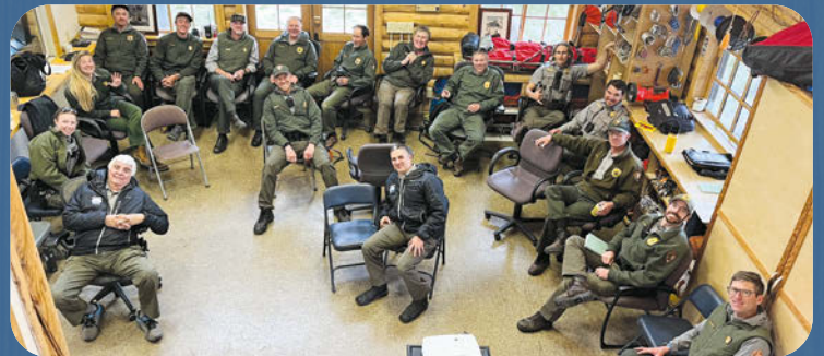
Top: The Jenny Lake Rangers practice lowering patients in steep, rocky terrain using ropes and litters. Middle: Communication is key during all rescue operations. Here, the team on-the-ground is working with the helicopter pilot during a short-haul rescue. Bottom: The Jenny Lake Rangers consist of permanent and seasonal rangers, as well as volunteers.

The Foundation is proud to fund this initiative and support the passionate young adults who want to dedicate their lives to helping those in need.