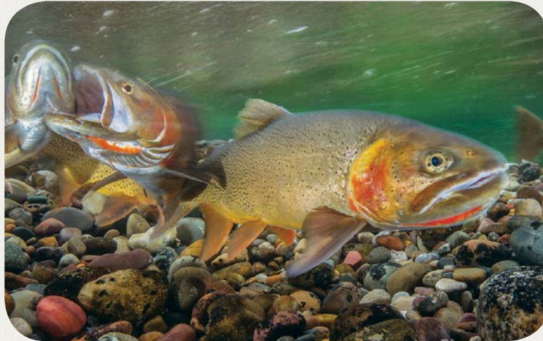
Snake River fine-spotted cutthroat trout.

developments and activities. In 2017, after completion of several habitat improvement projects, fish movements between the Snake and twenty-three miles of trout habitat became possible once again.