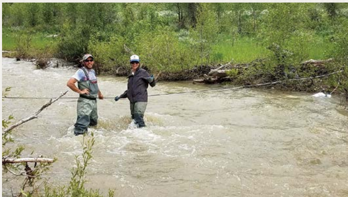
Above: Biologists install equipment to track fish passage in Ditch Creek. Right: A biologist inserts a small device into a trout so its movements can be monitored.