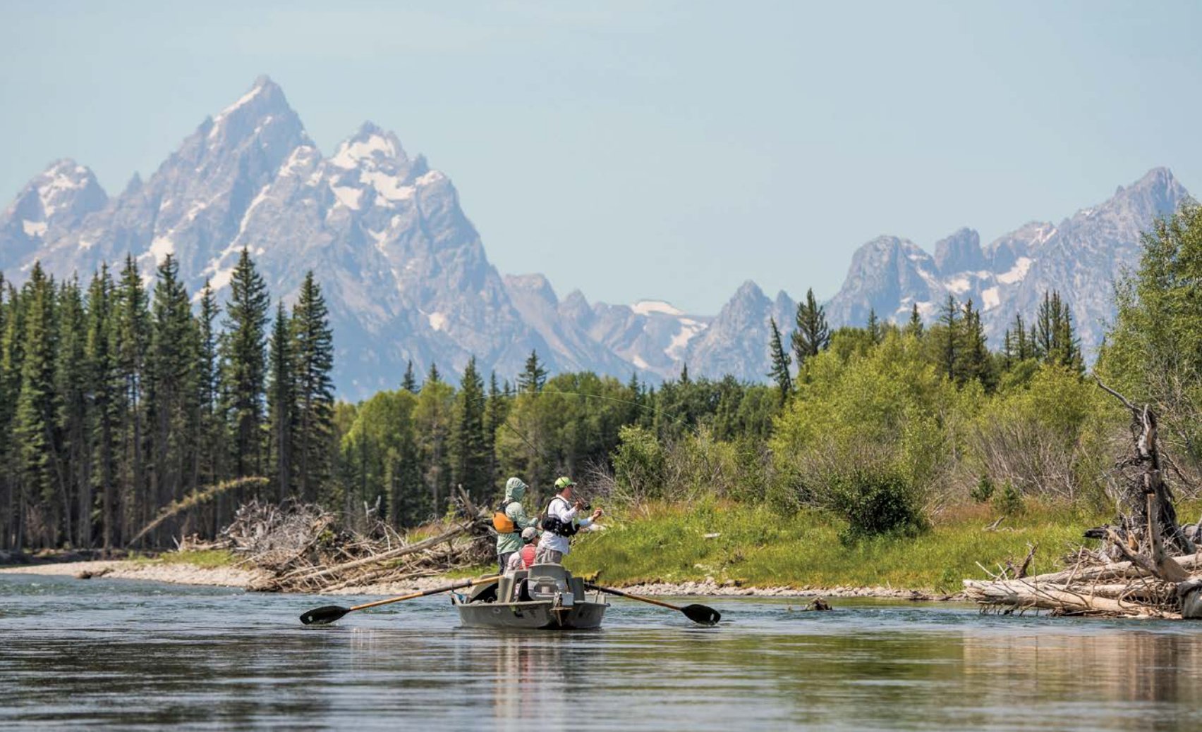
Above: Anglers enjoy fly fishing on the Snake River in Grand Teton National Park.