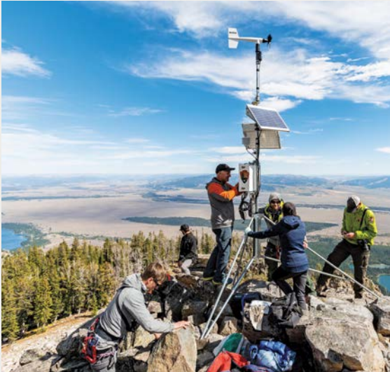
Below: New weather station being installed near Surprise Lake.