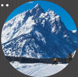
Jenny Lake Grooming

Grooming is slated to begin in mid-December and will continue through mid-March—but we need your support. Donate today by visiting www.gtnpf.org/donate and list “grooming” in the comments field. Thank you!