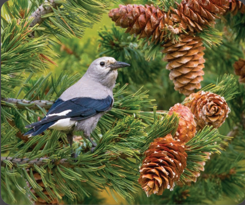
Photo Above: Clark's Nutcrackers are one of many species that depend on whitebark pine for food and shelter.