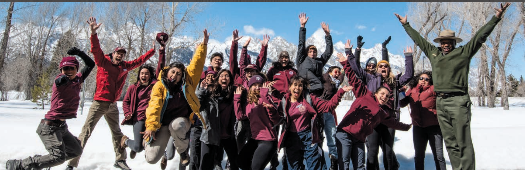
Cultivating the Next Generation of Park Leadership—NPS Academy

Grand Teton National Park Foundation received gifts from the following donors between October 1, 2019 – September 30, 2020. Please contact Alex St. Clair at (307)732-0629 with corrections.