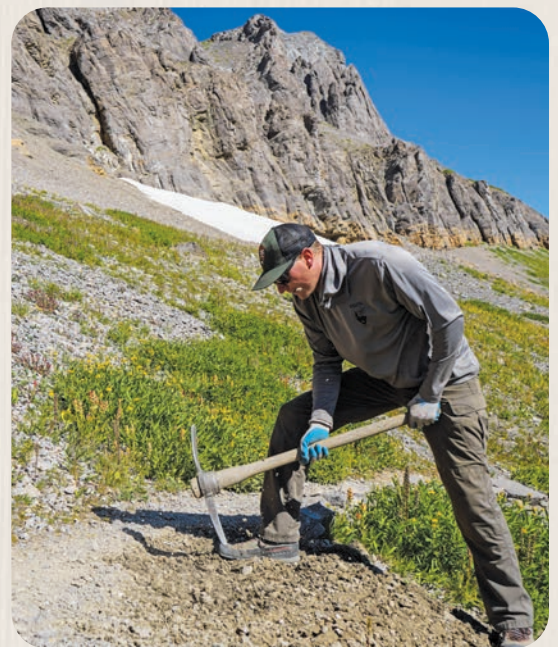
Park crew members complete drystone masonry and trail regrading on the path that leads to Hurricane Pass.

supplies and equipment to isolated locations, and that was just the beginning. They had to find the best route, complete challenging manual labor to build every foot of trail, and keep going on and on in what had to seem like an endless expanse of rugged alpine terrain.”